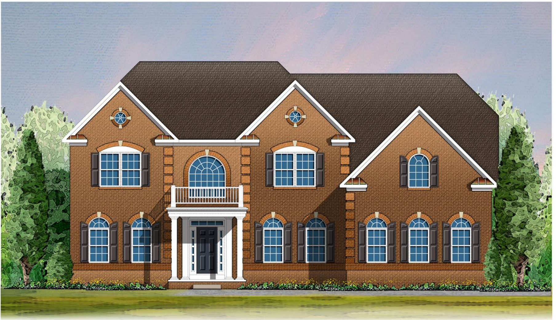
ELEVATION II WITH OPTIONAL BRICK, PORTICO AND SIDE LOAD GARAGE.

Details and dimensions on these plans are approximate and subject to change. Illustrations are artist's concept and may vary in detail from plans and specifications. MHBR#152