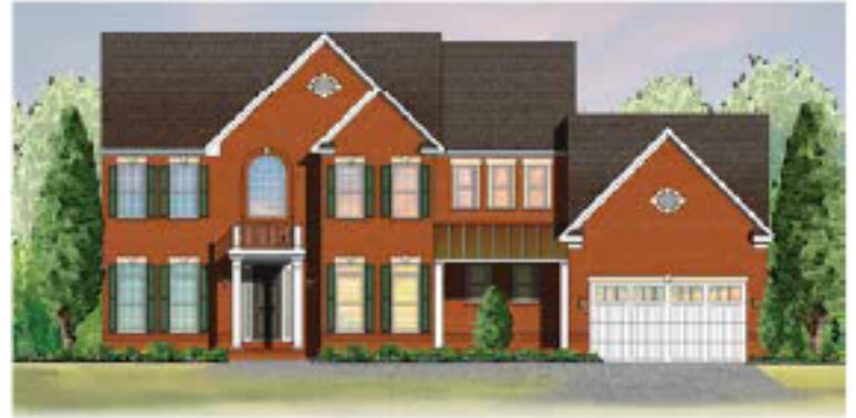
ELEVATION II WITH OPTIONAL BRICK AND OPTIONAL SECOND FLOOR PLAN