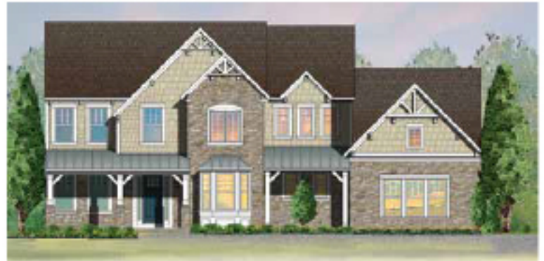
ELEVATION IV WITH OPTIONAL STONE, OPTIONAL SECOND FLOOR PLAN, OPTIONAL METAL ROOF AND OPTIONAL SIDE GARAGE