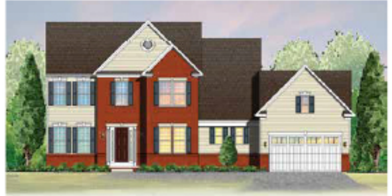
ELEVATION I WITH OPTIONAL BRICK